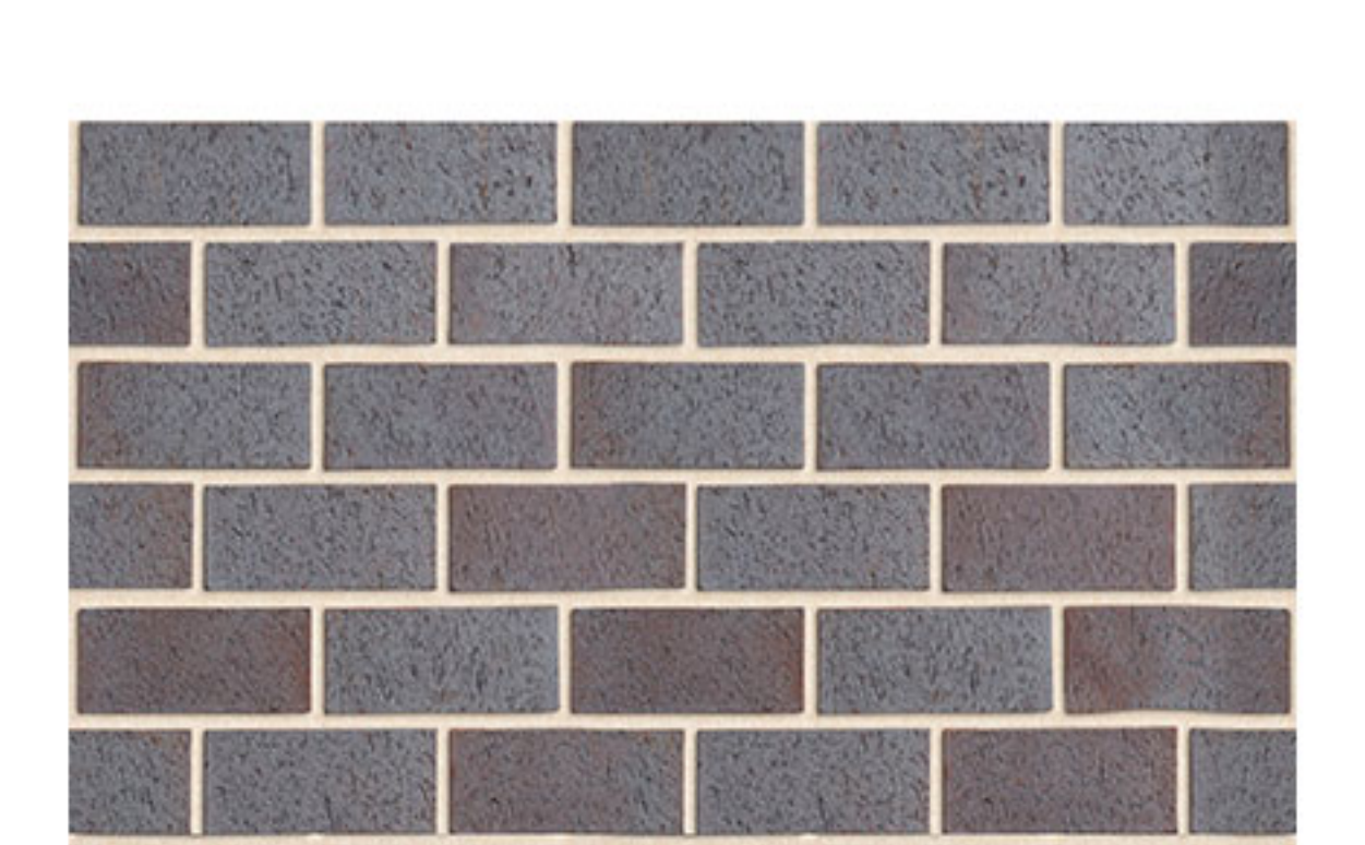
2- PGH Bricks Blue Steel Flash colour (or equivalent)