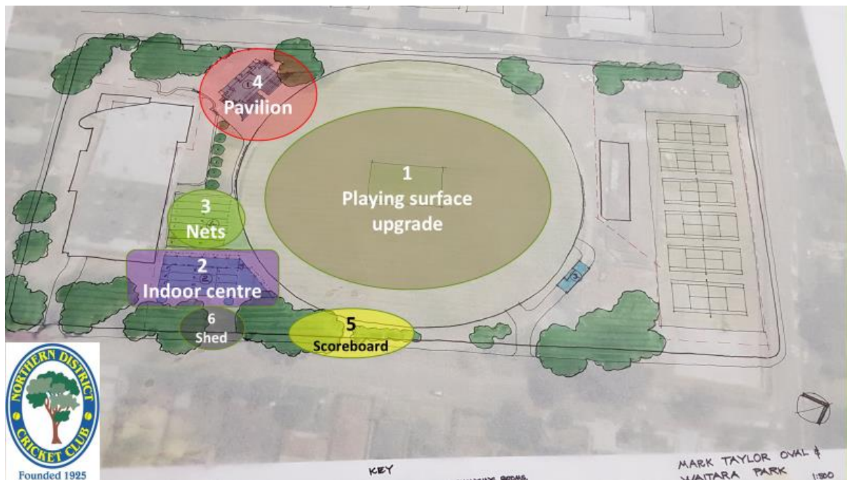
Figure 1: Masterplan of works for Mark Taylor Oval

The Club funded the early investigative work on the Project from its own resources, and a grant from CricketNSW.