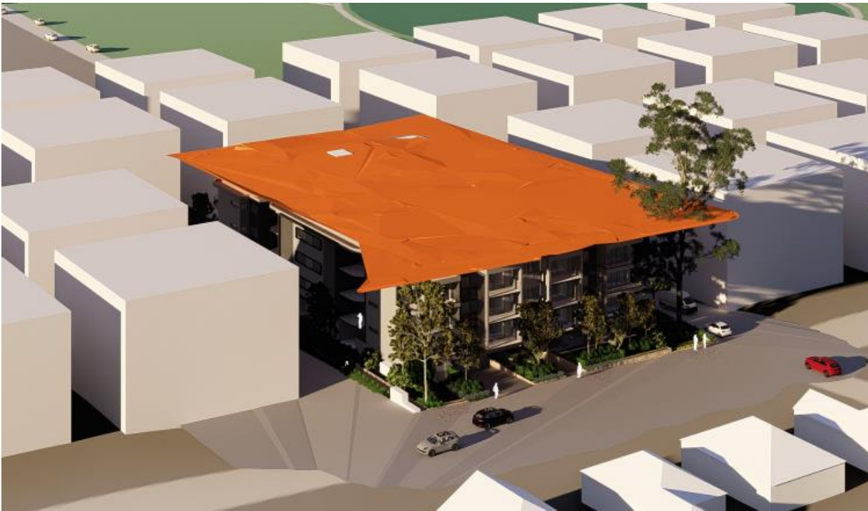
Figure 1 - Building height breach blanket diagram